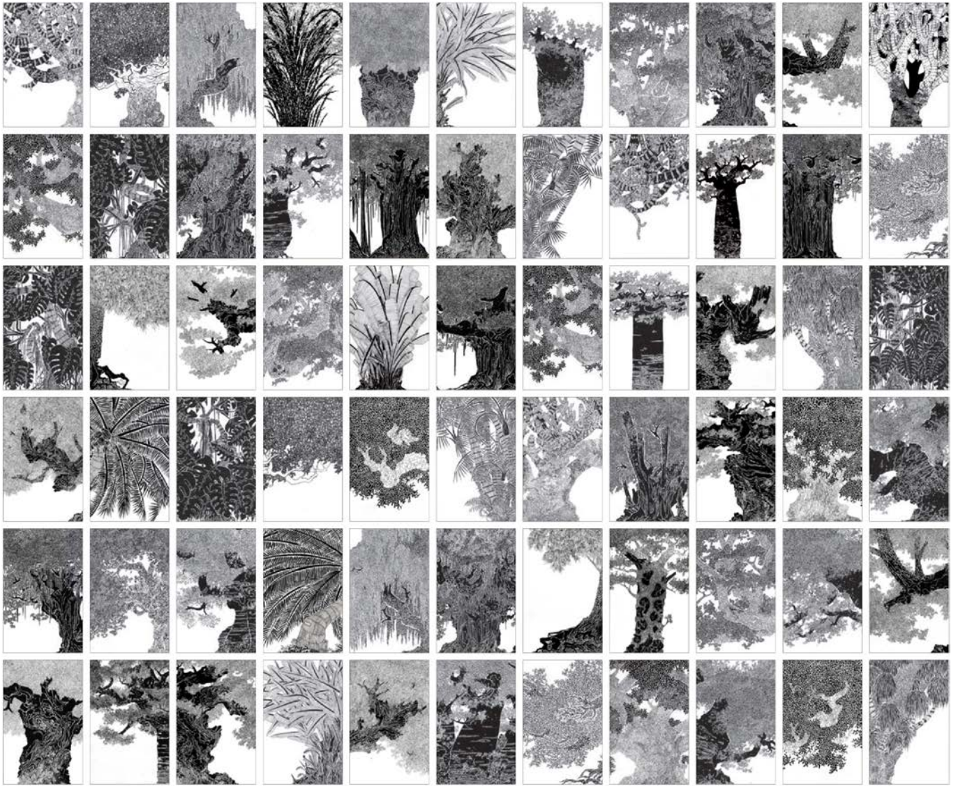
Stefano Alaimo - Army India ink on paper/8,5x12cm per growing number of sheets (work in progress)