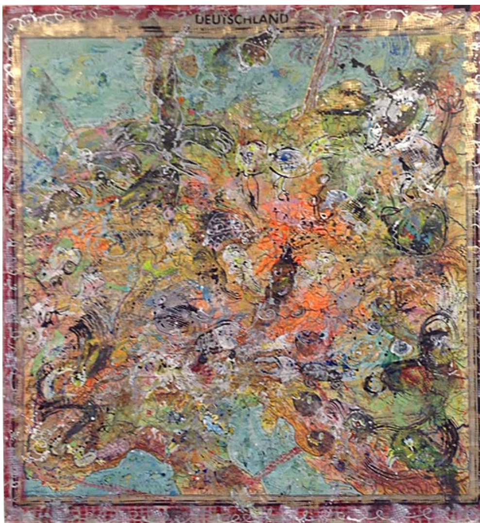
Suisse Marocain - No title Acrylic, collages on print paper / 125x135cm