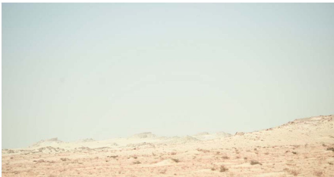
Rachele Cassetta - Desert Digital print on photographic paper, 190(h) x 365(w)cm