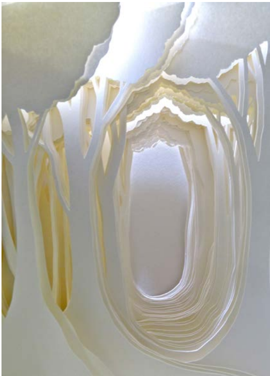
Ayumi Shibata - Kagami

Hand-cut-paper work / 21x21cm, 32 sheets 2016